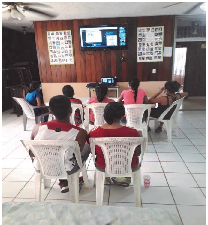
In-Person and Online Classes at the Hogar

The full newsletter and more pictures are online. Visit https://www.popplano.org/sister-parish