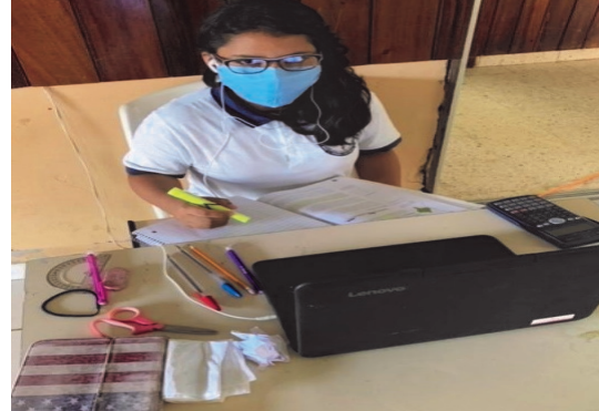
Above: More Online Learning!