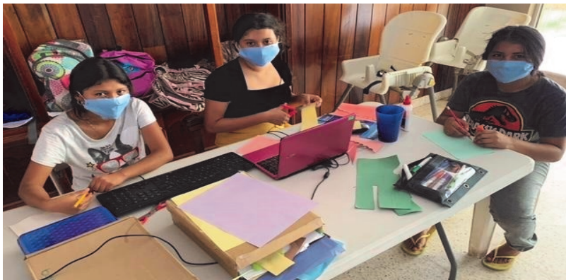
Online Classes at the Hogar