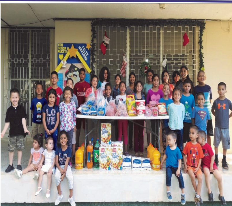
Many Thanks and Best Wishes for the New Year from the children and staff of the Hogar and Nutrition Center of Las Mercedes