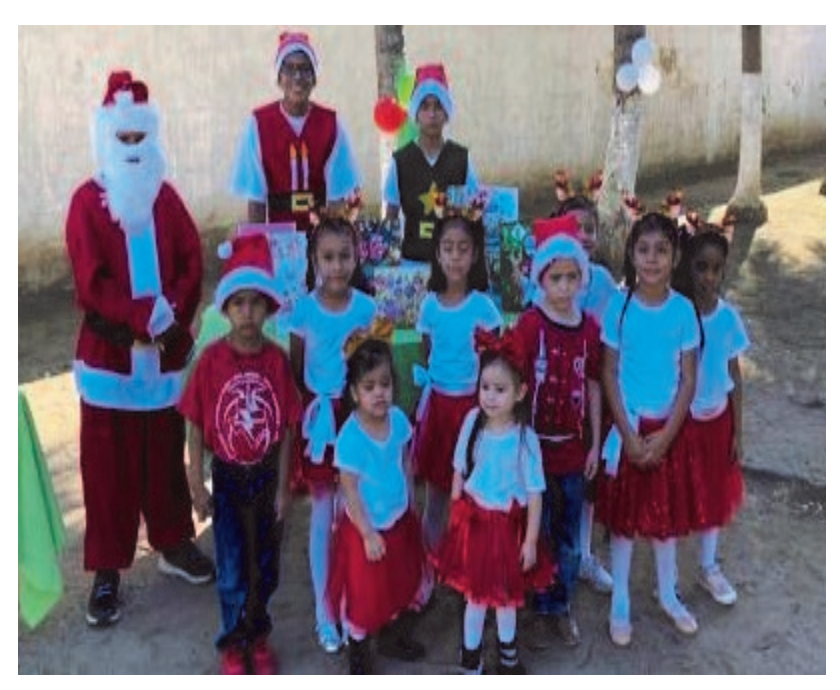
Merry Christmas and Happy New Year to all!