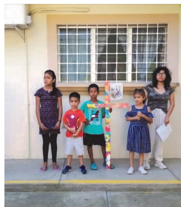
Left: More Lenten Activities