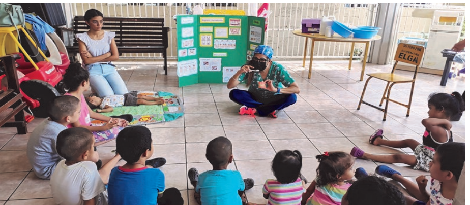
Oral Health discussion