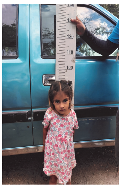
Health checkups and height and weight assessment

The full newsletter and more pictures are online.